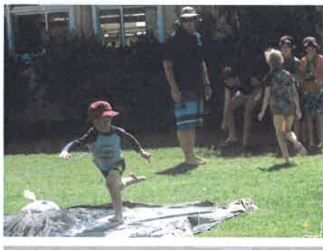
Photo: some winners of Bronze Awards enjoying their 'Wet Play' reward day!

Text – World - Students connect what they are reading to something they have heard about, seen, or that others have experienced.