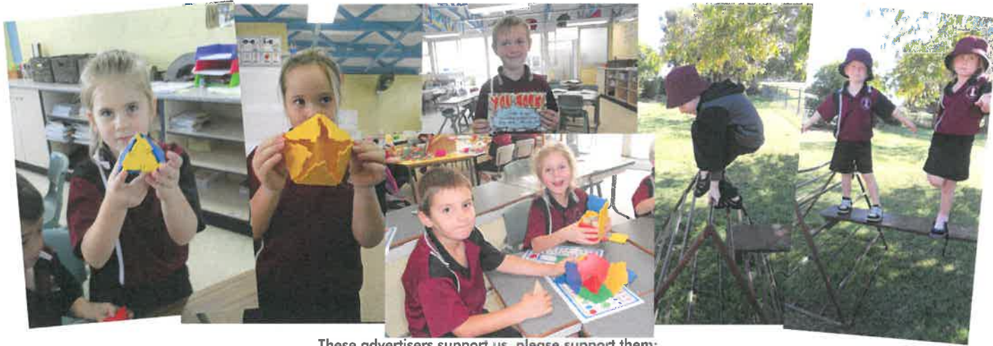
These advertisers support us, please support them: