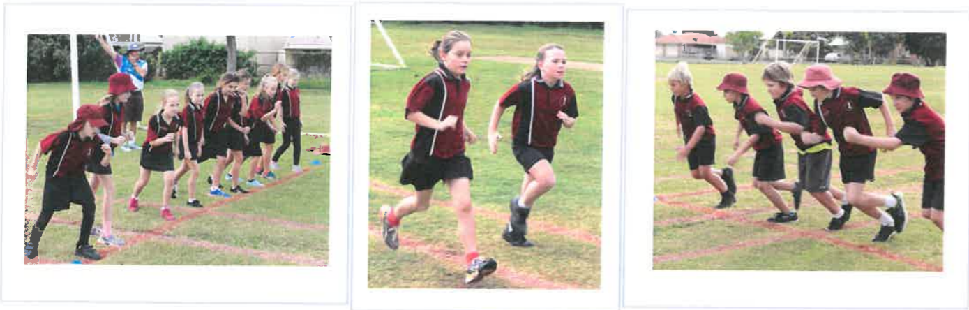
These advertisers support us, please support them: