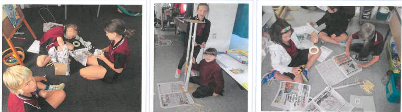
These advertisers support us, please support them:

YEAR 4 SCIENCE - Today the Year 4 students were working in small groups with familiar materials to construct a tower. The challenge was build a tower in twenty minutes that would support the weight of a dictionary. There were some quite unique designs constructed during this time. After testing their towers the students reflected on their designs and discussed the successes and why some structures collapsed.