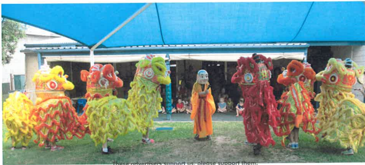
These advertisers support us, please support them.