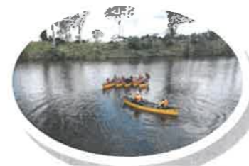
CANOEING ON THE RIVER AT BUCCA