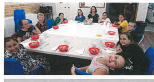
DINNER AFTER A BIG DAY ON THE WATER