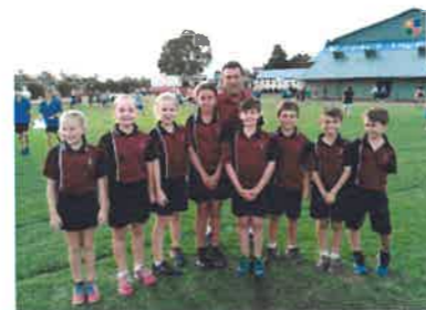
BHSS CROSS COUNTRY TEAM

WELL DONE to the students who participated in the Cross Country on Wednesday 04 May. All students completed the distance for their age groups and successfully represented the school demonstrating attitude and sportsmanship.