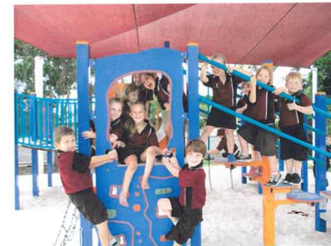
PREP/1 ENJOYING THEIR PLAYGROUND EQUIPMENT