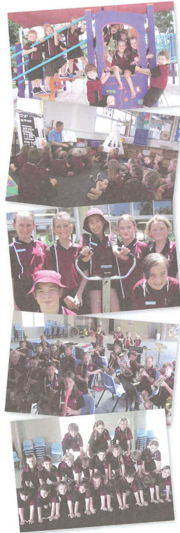
Progress through Participation