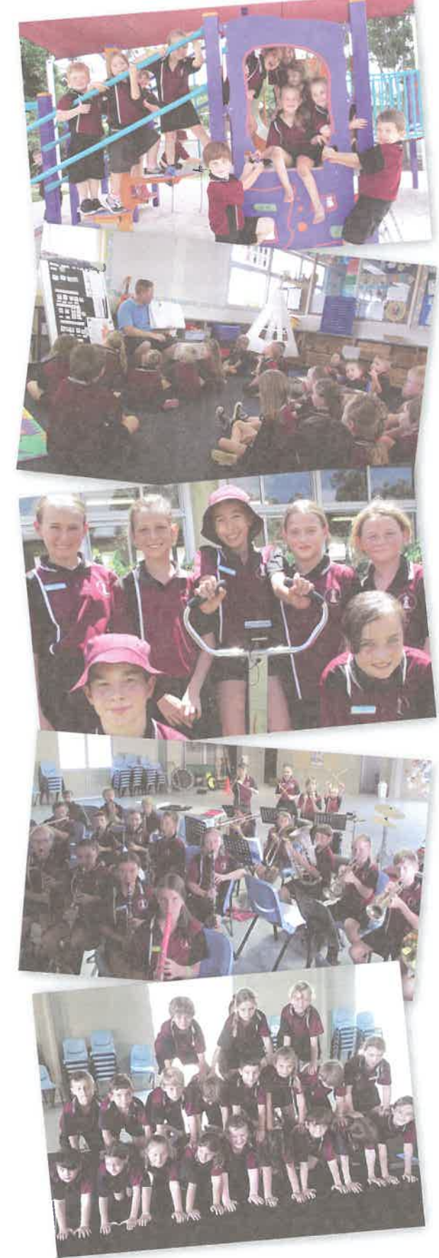
Progress through Participation